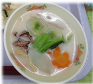
Asuka nabe hotpot dish with Yamato Nikudori