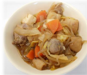
Chicken sukiyaki hotpot dish