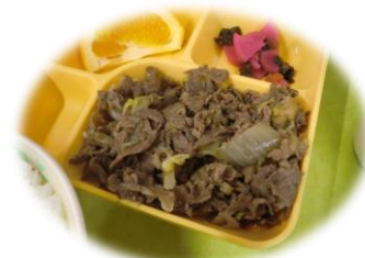
Yamato beef sukiyaki hotpot dish