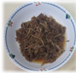
Beef and burdock root cooked with sugar and soy sauce