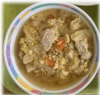
Oyakodon (chicken and egg rice bowl) with Yamato Nikudori chicken