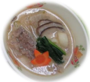
Soybean sake lees soup with Yamato beef